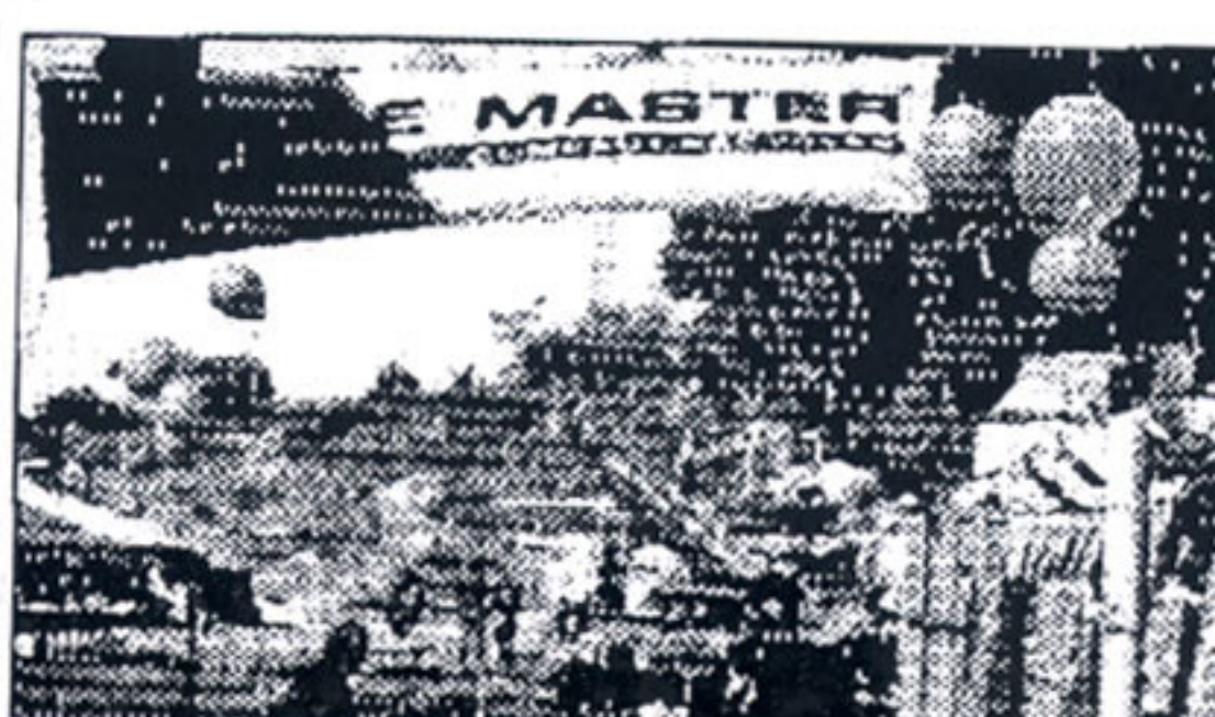
Garofalo Contractors and DAG Mobile Aggregate Recycling Open House, Lynduhurst, NJ