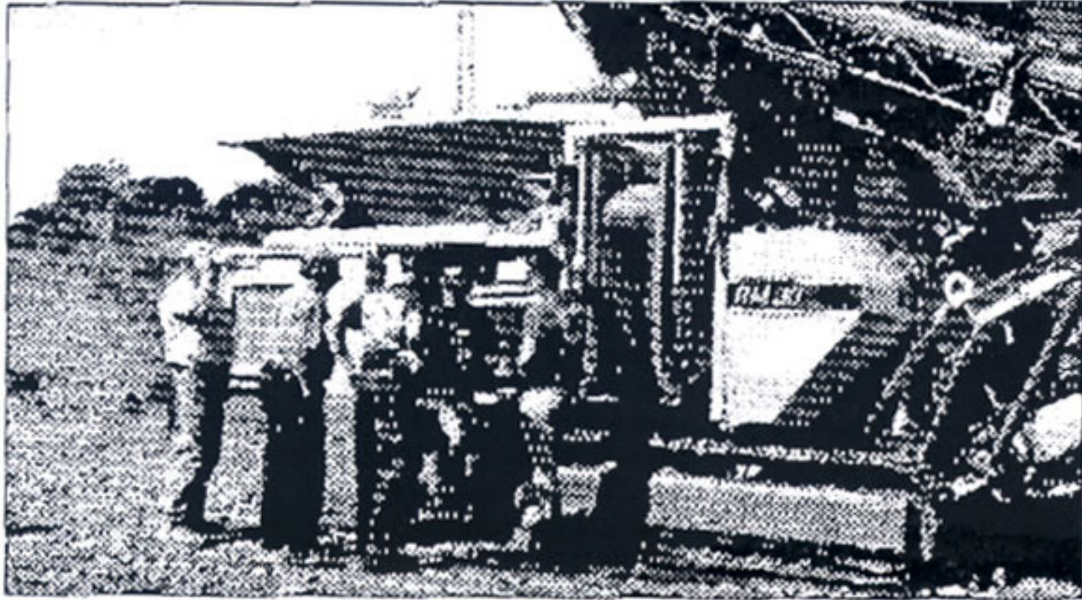
Attendees checking out the RM80.