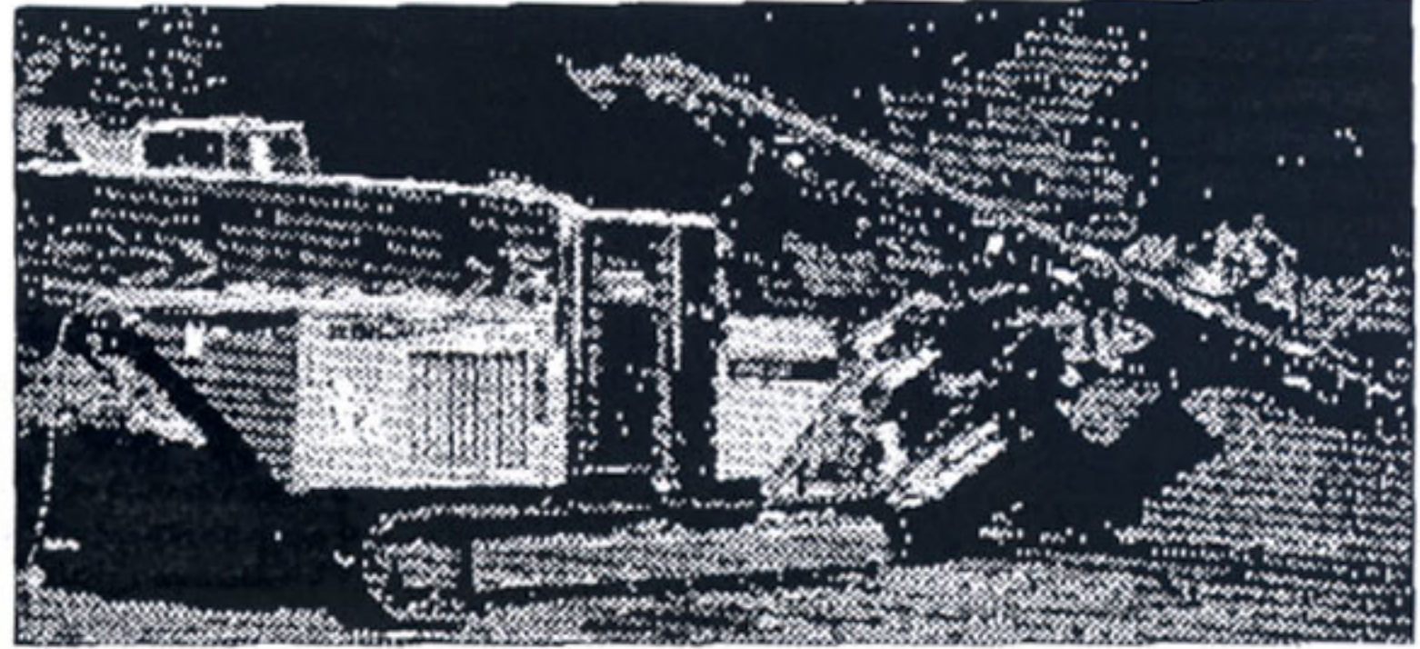
Block and concrete before and after

Garofalo started DAG Mobile Aggregate Recycling to do contract crushing on customer's site. Up and crushing in 15 minutes. DAG can produce approximately 165 tons of product per hour from asphalt, rock, brick and block (no problem with rebar). For more information, contact DAG Mobile Aggregate Recycling at 201-438-6858 (ph). For more information on Construction & Industrial Equipment Corporation, contact Jack Moninger at 201-845-6800.